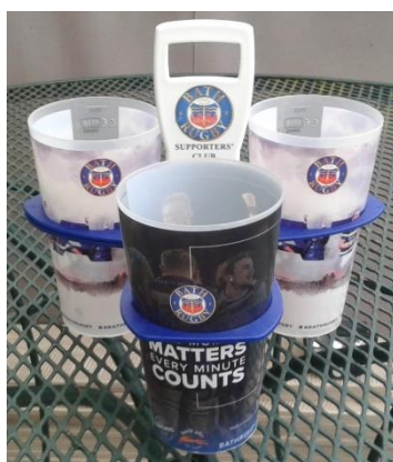
Drinks carrier – cups not included