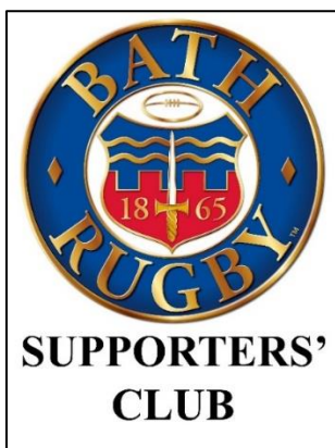
Car Window Sticker