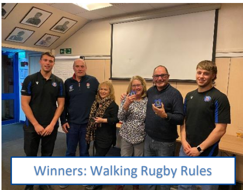
Winners: Walking Rugby Rules