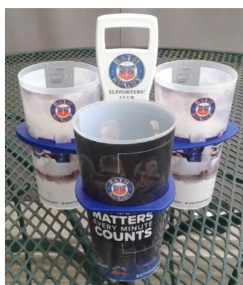
Drinks carrier – cups not included