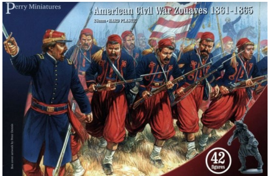
Left A Zouave Uniform from the American Civil war (1861-1865)