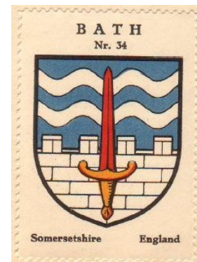
Coat of Arms - City of Bath (1971)