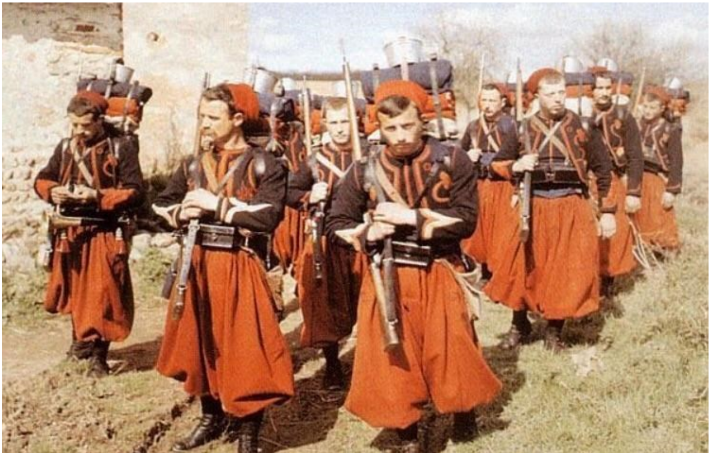
Below French Zouaves during WW1 (1914)