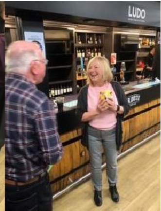
Winner of the Heads/Tails quiz