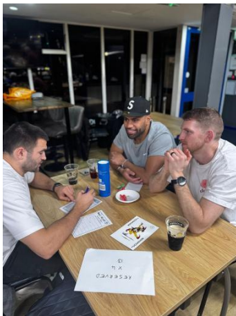
General Views of the Quiz Night