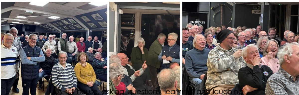
A full house asking questions, learning and laughing.

Spreadbury himself is no fan of protracted conversations between referees and TV match officials and oversees a more streamlined process in EPCR competitions than we see in Prem rugby. 'Clear and obvious' is the message to his officials.