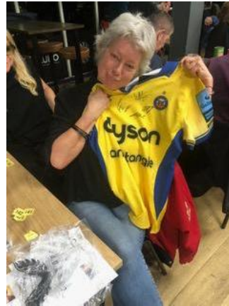
Winner of the Raffle